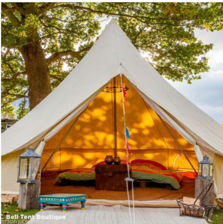
Bell Tent Boutique graphy.co