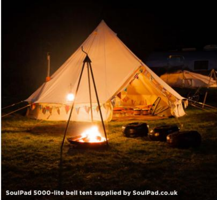
SoulPad 5000-lite bell tent supplied by SoulPad.co.uk